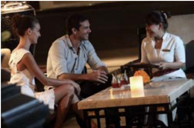
Wi-Fi allows the staff to engage guests anywhere in the hotel

The InterContinental Bali Resort began using Ubiquiti products in 2007 and has remained a loyal Ubiquiti customer for the last seven years, using UniFi APs and outdoor units to enable Internet coverage for the entire 18-hectare (44.5-acre) resort.