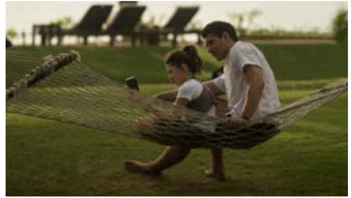
Guests have access to the Internet outdoors