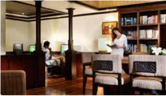
All areas, including the Inspiration Library, have Wi-Fi coverage