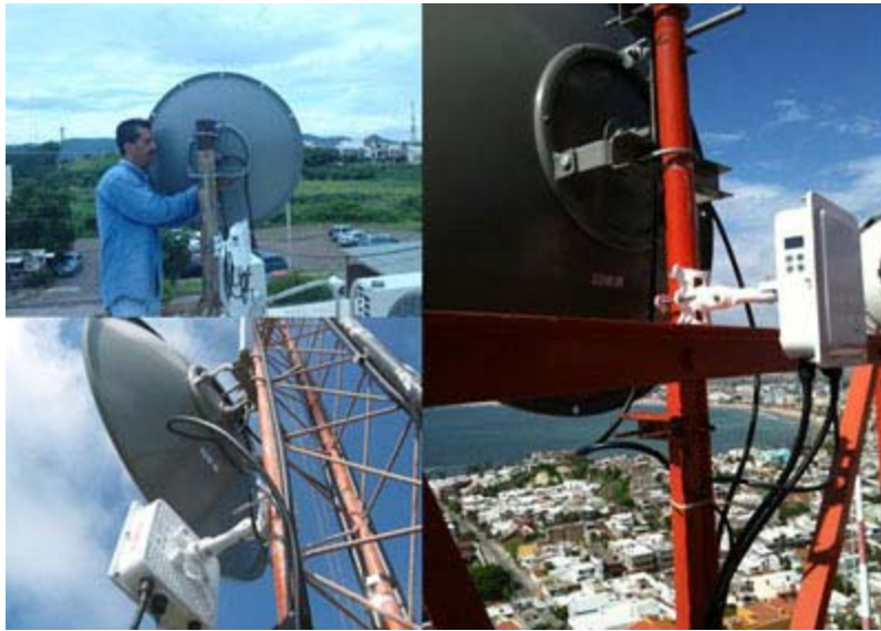
Picture 4. LigoPTP MiMo in Mexico