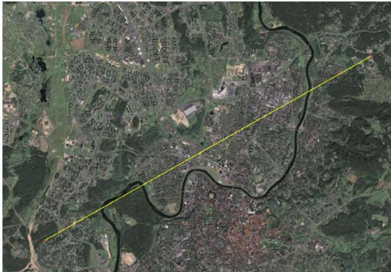
Picture 1. 10 km link on map