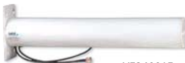
YE240015 Enclosed Yagi