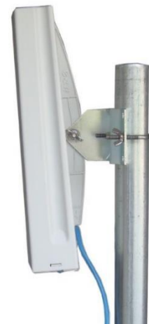
EZ-Bridge® LT tool-less installation