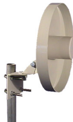
*Picture shown with standard pole mount bracket