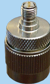
N Male to RPSMA Female