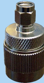
N Male to RPSMA Male