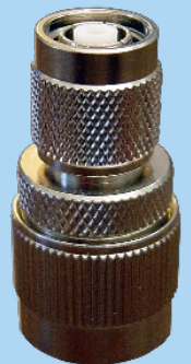
N Male to RPTNC Male