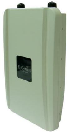
EOR7550 802.11a/b/g/n Outdoor Dual Radio Repeater

The deployment included EnGenius ECB9500 Business Class Long Range, Wireless N, Gigabit Access Points to provide on-campus connectivity inside the classrooms, and EOR7550 Business Class 802.11a/b/g/n Outdoor Dual Radio Repeaters to provide the campus-wide outdoor link for network access and bridging to the remote facilities.